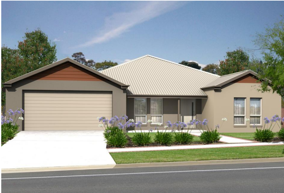
LOT 2 JUNCTION ROAD BALHANNAH