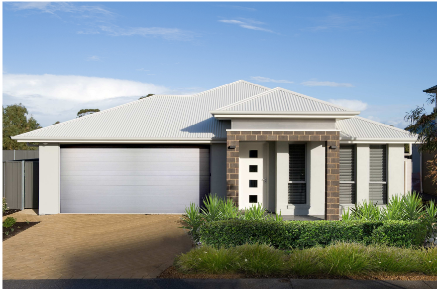
House 2 lot 39 Beltana Ave, Modbury North