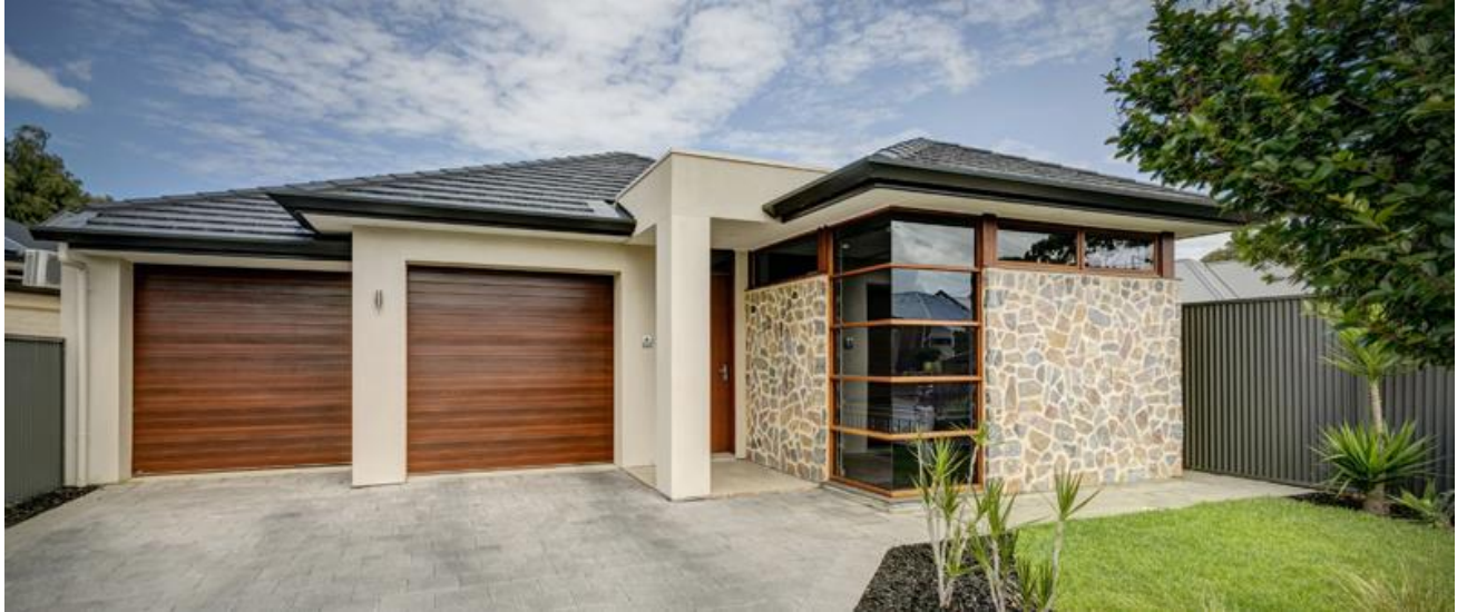
Alternate elevation to illustrate alternate design options for the home.